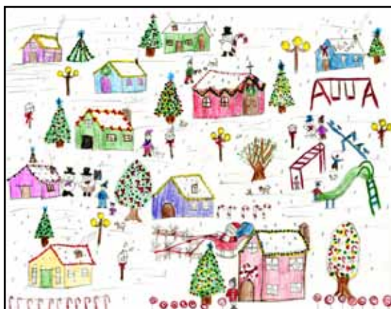
Nancy Garcia Roach Elementary